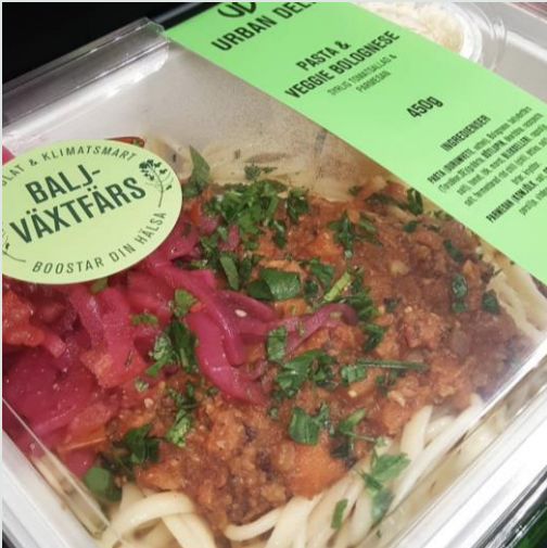
Fine-tune the product together with a customer (live-lab)