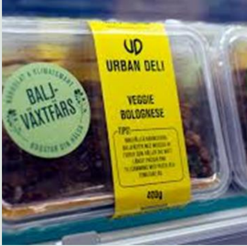
Develop end products that will generate enough profits in the value chain