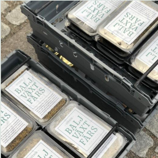
Proof of concept